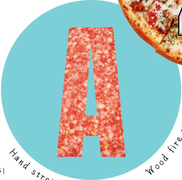
Hand stretched base