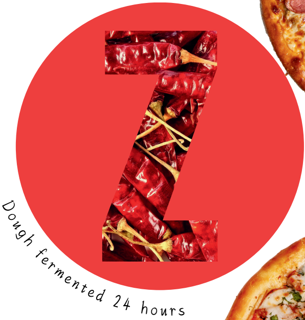
Dough fermented 24 hours