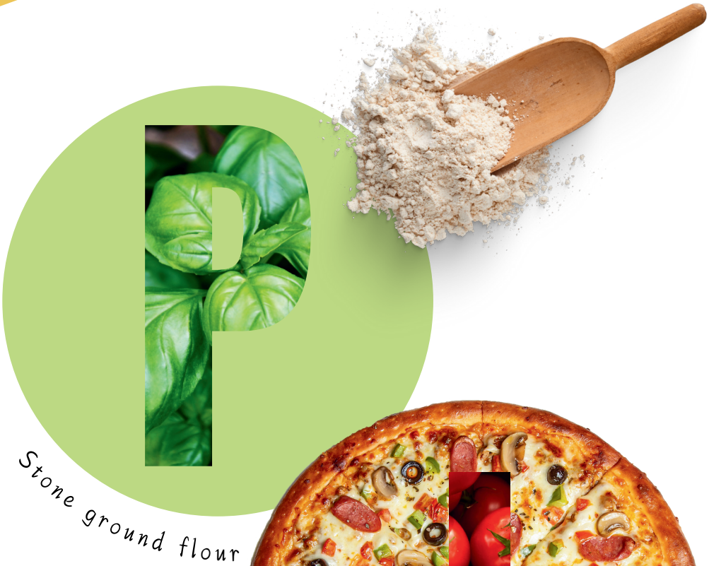
Stone ground flour